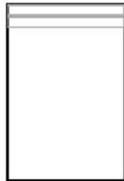
1 GALLON FREEZER BAG ZIPOC OR SIMILAR NO LARGER THAN 12" X 12"